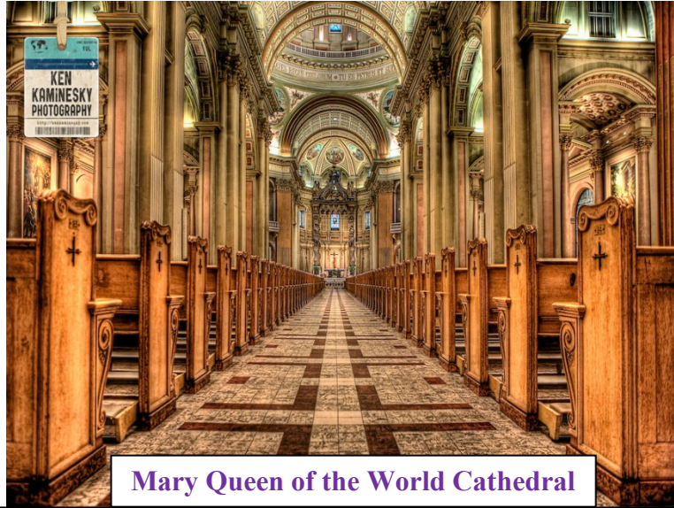
Mary Queen of the World Cathedral